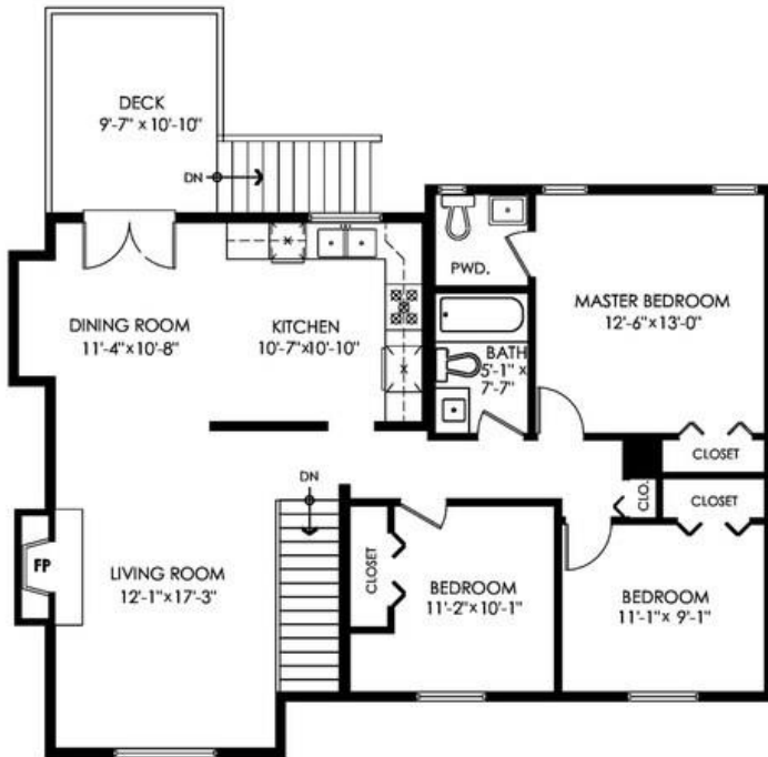
Main Floor Plan Floor Area: 1135 sq.ft. Ceiling Height: 8'

Garage: 316 sq.ft. Deck: 108 sq.ft. Porch: 72 sq.ft. Total Extras: 496 sq.ft.